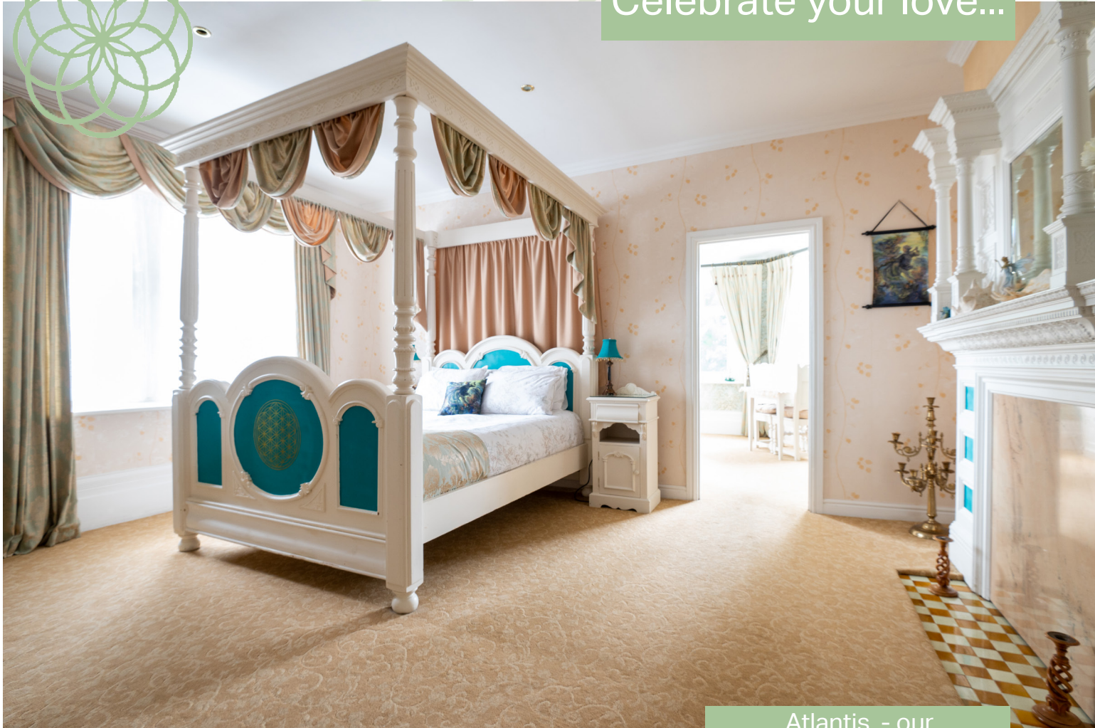
Atlantis - our honeymoon suite

Each of our 8 luxurious guest suites & rooms are unique and boast the magnificent artwork of world famous fantasy artist, Josephine Wall. The sumptuous bedding ensures a good nights sleep and the lounges are cozy and inviting.